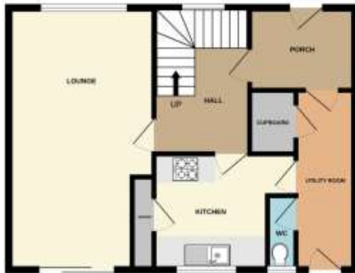
GROUND FLOOR 547 sq.ft. (50.8 sq.m.) approx.