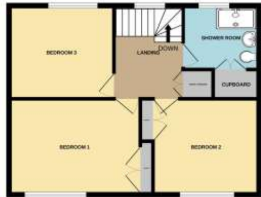
1ST FLOOR 547 sq.ft. (50.8 sq.m.) approx.