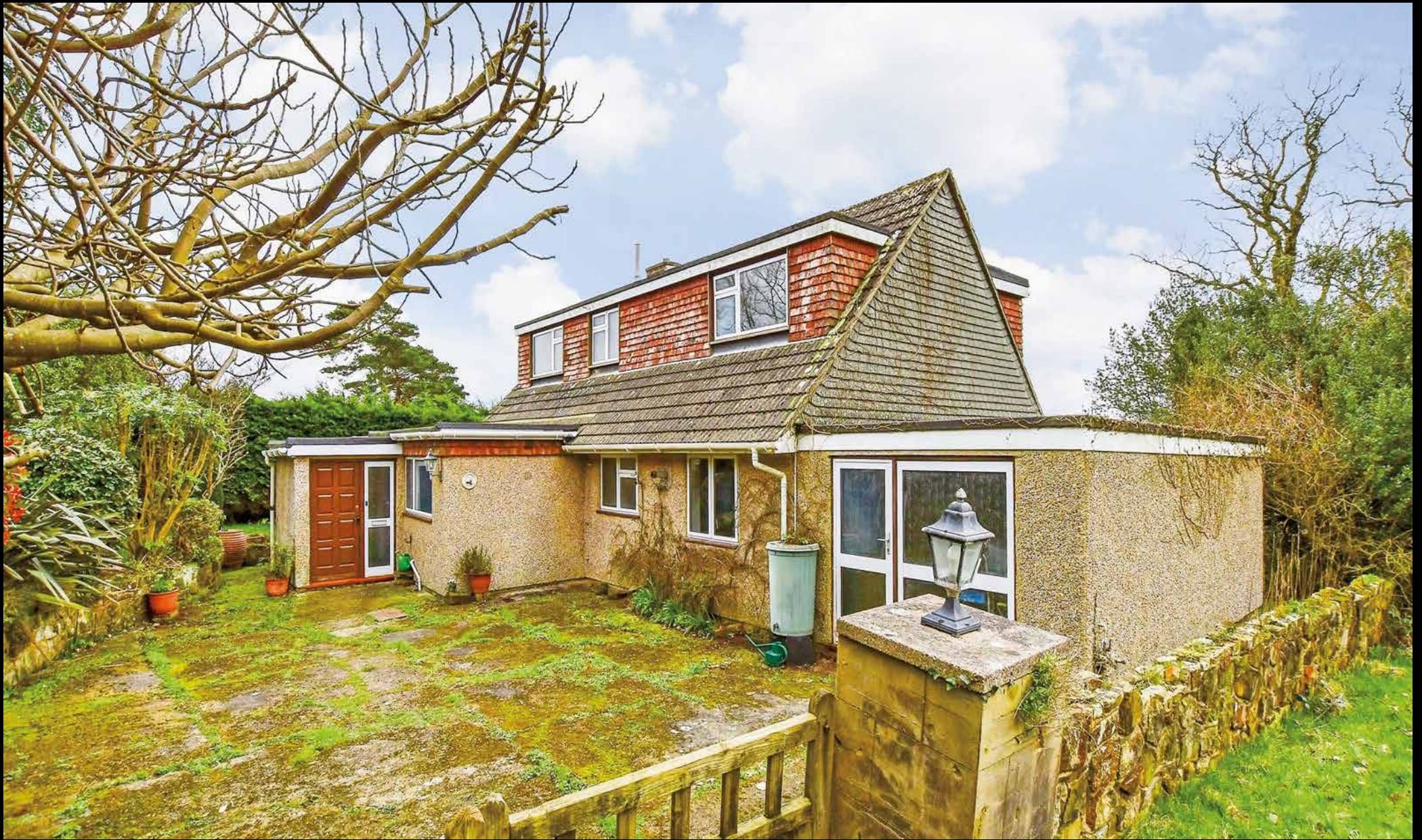
Crest Cottage New Road | Duddleswell | Uckfield | East Sussex | TN22 3JJ