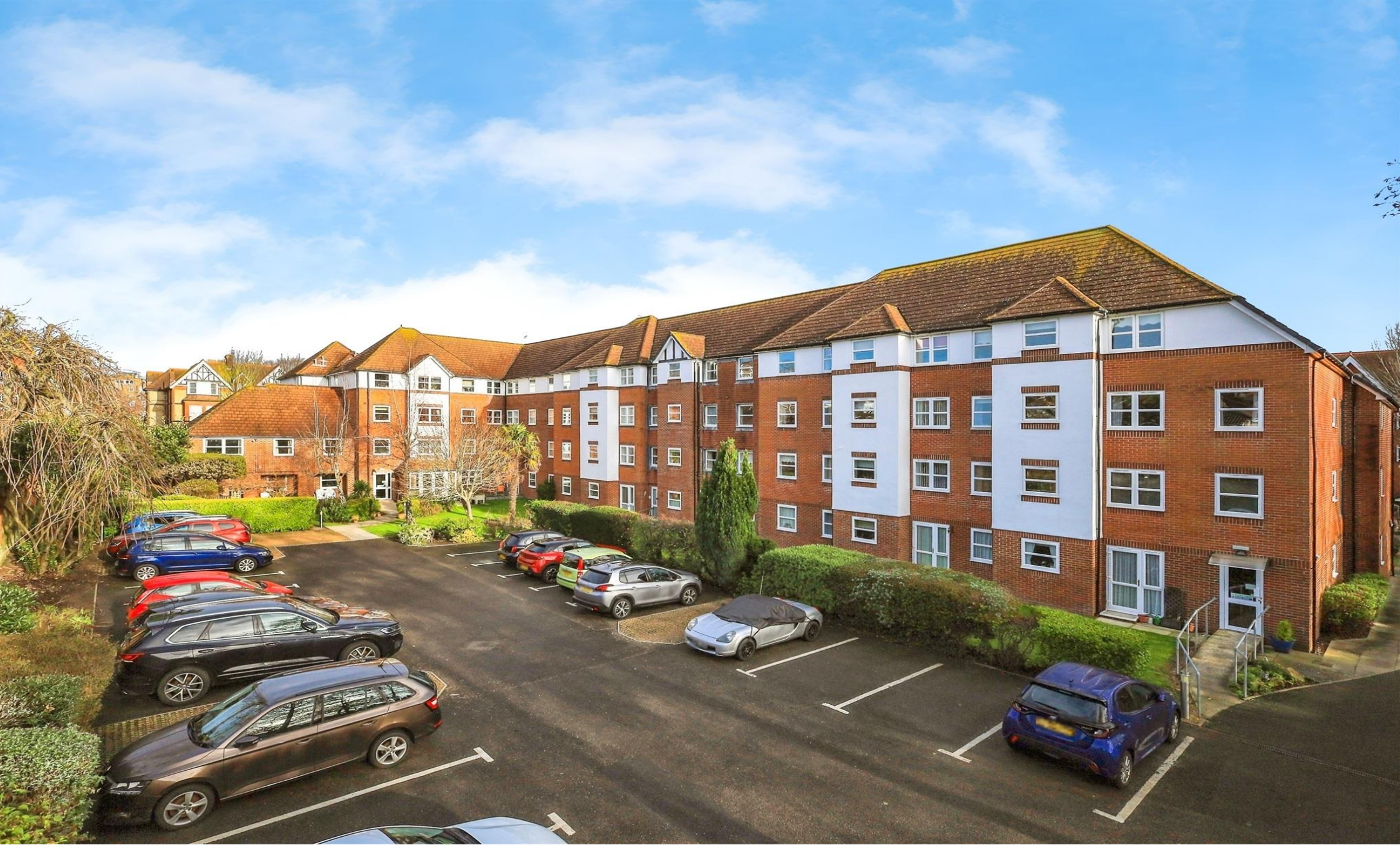
Colonel Stevens Court Granville Road, Eastbourne BN20 7HD