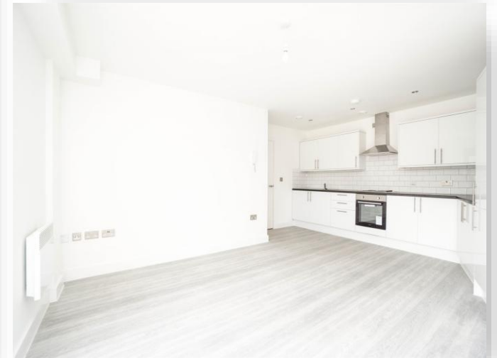
Prenton Court, Elm Road North, Birkenhead CH42 9PA