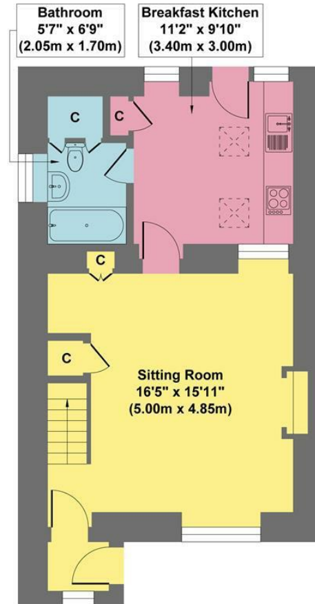
Ground Floor Approximate Floor Area 476 sq.ft (44.24 sq.m.)