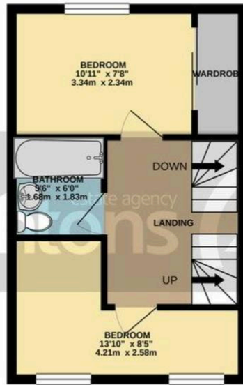
1ST FLOOR 306 sq.ft. (28.4 sq.m.) approx.