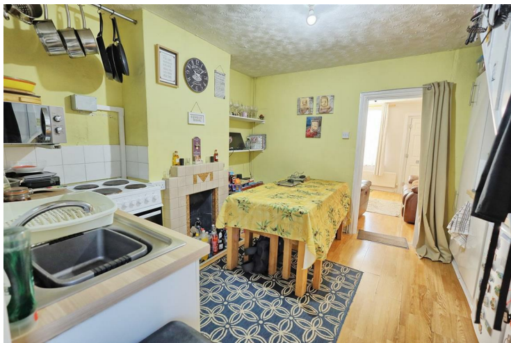
KITCHEN/DINING ROOM 11'5" x 11'9" (3.5 x 3.6)