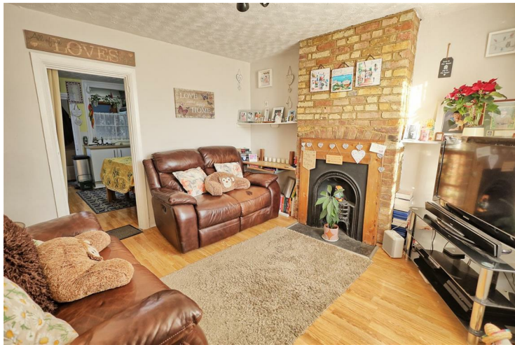
LIVING ROOM 11'8" x 11'8" (3.58 x 3.56)