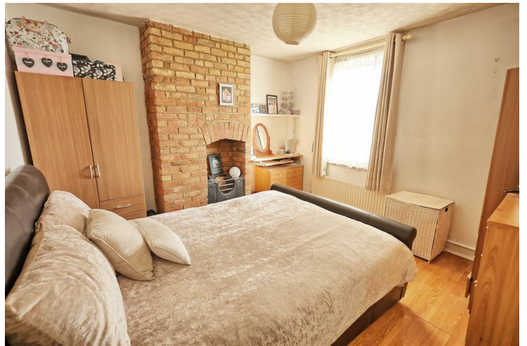
BEDROOM ONE 11'5" x 11'5" (3.5 x 3.5)