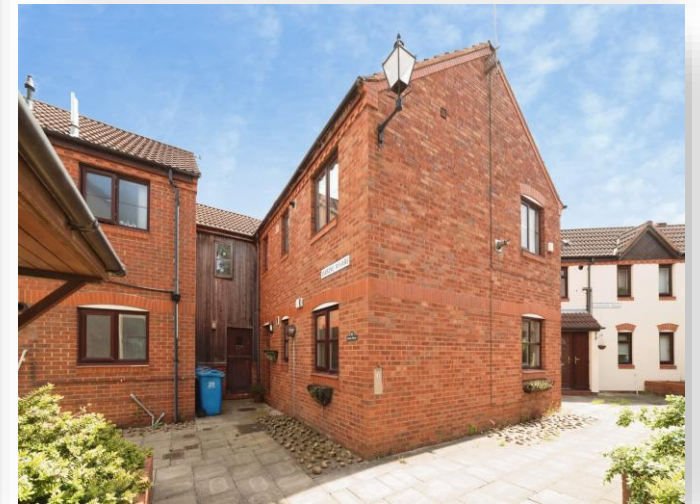
Marine Wharf, HULL HU1 2TY