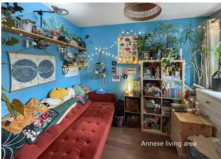
Annexe living area