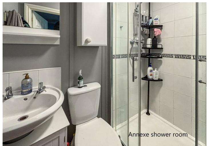
Annexe shower room