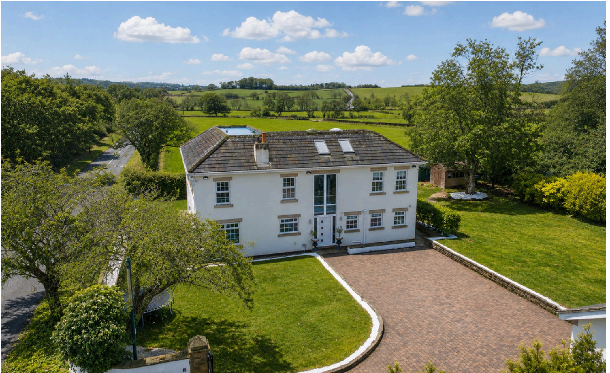
Moor Cottage, Moor Road, Bramhope, LS16 9HN