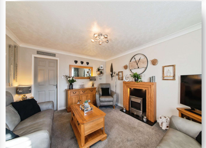
Godson Avenue, Heckington Sleaford NG34 9SB