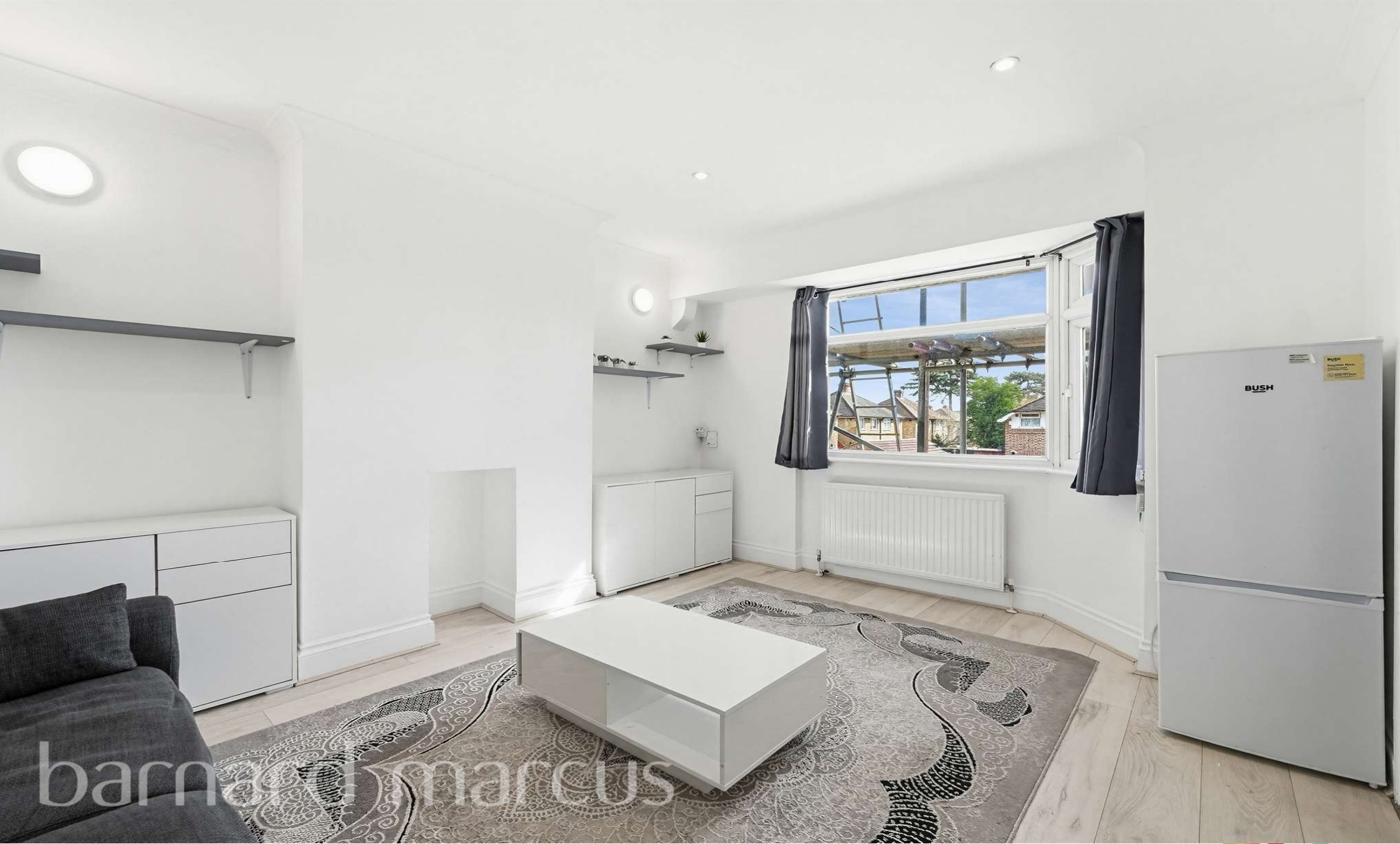
Elmcroft Close, Feltham TW14 9HJ