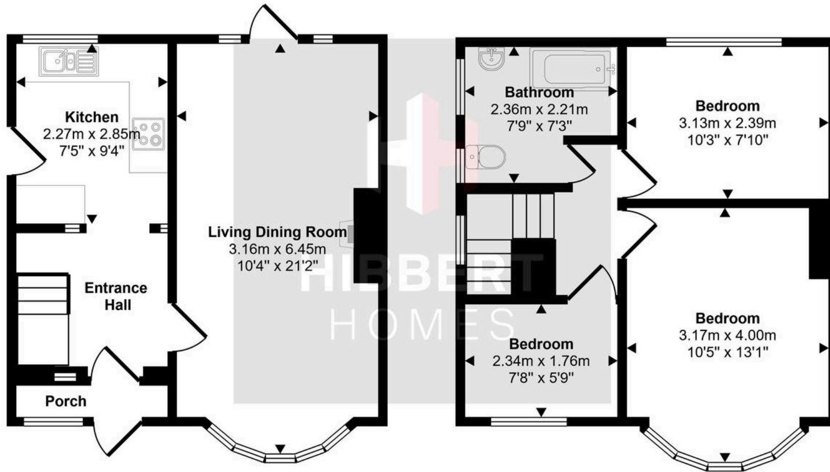
Ground Floor Approx 34 sq m / 366 sq ft

Approx Gross Internal Area 68 sq m / 736 sq ft