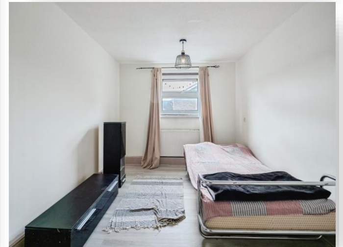
Scalpay Close,Leicester LE4 0QT