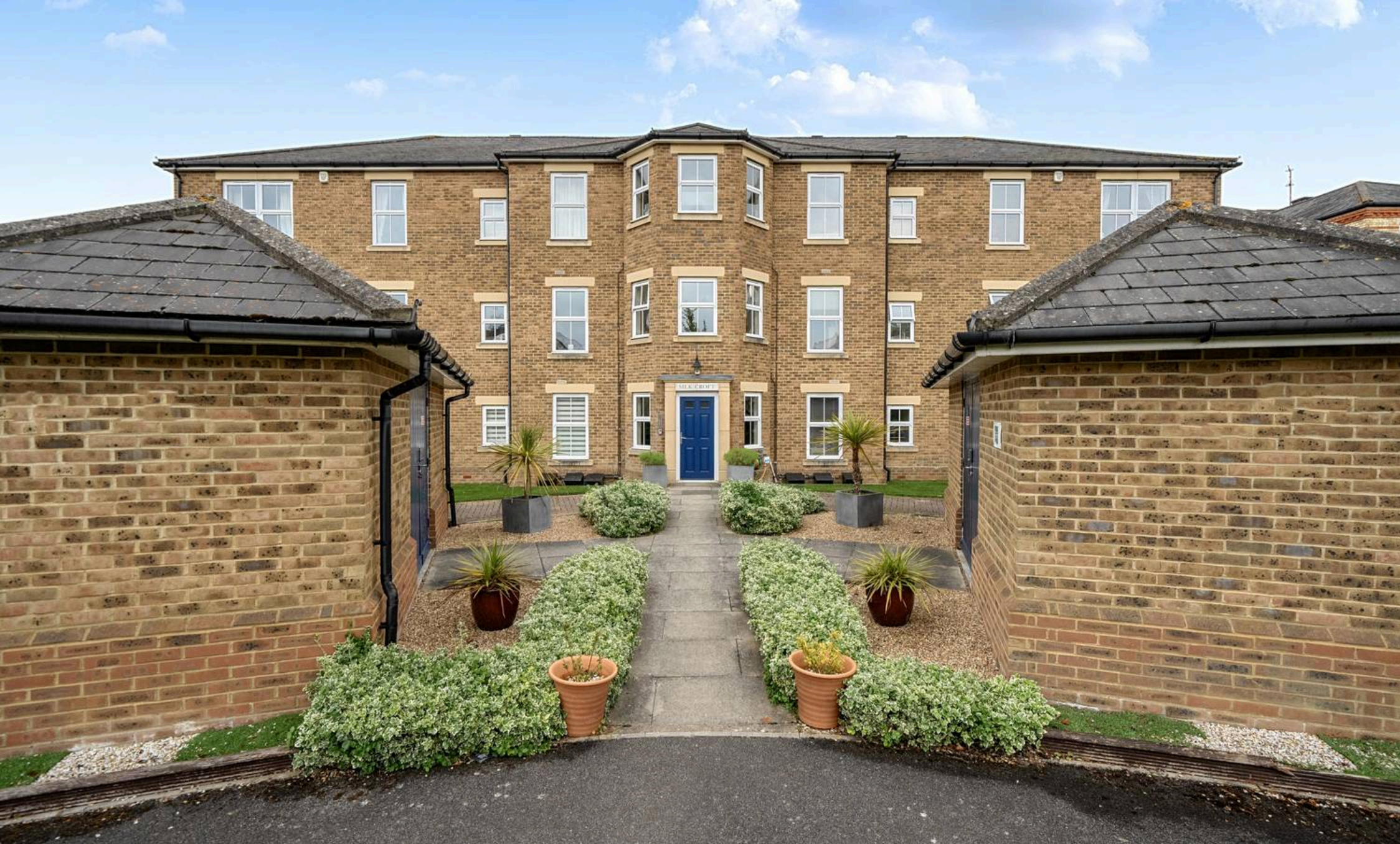
Silk Croft, Horton Crescent, Epsom