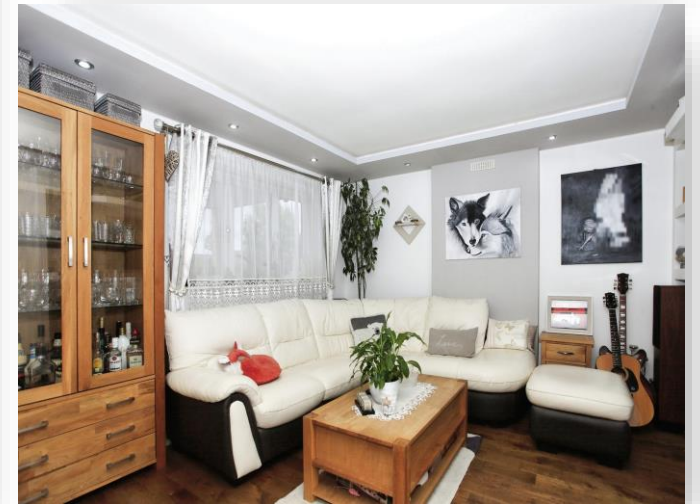
Dorchester Crescent, Peterborough PE1 4RP