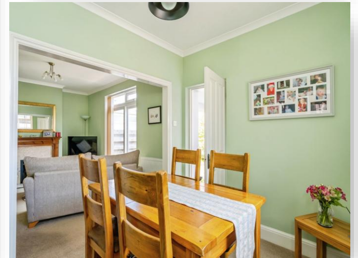
Seaway Steyne Street, Bognor Regis PO21 1TJ