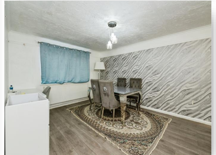
Tennyson Road, Peterborough PE1 3JD