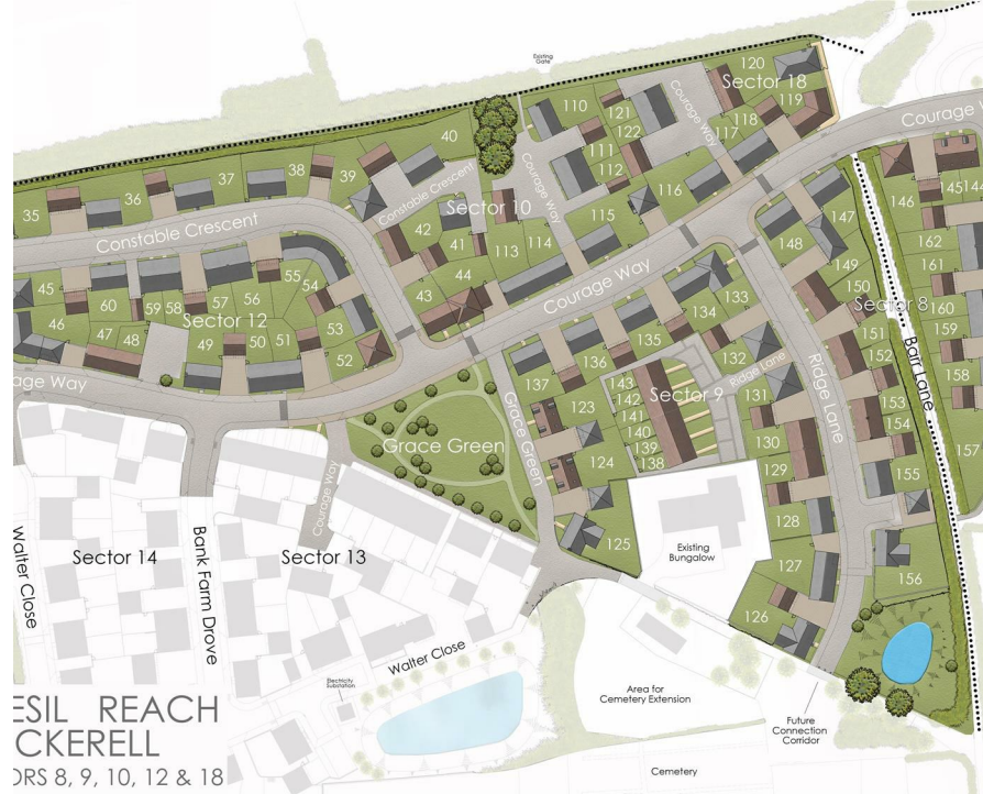
CHESIL REACH CHICKERELL DRS 8, 9, 10, 12 & 18