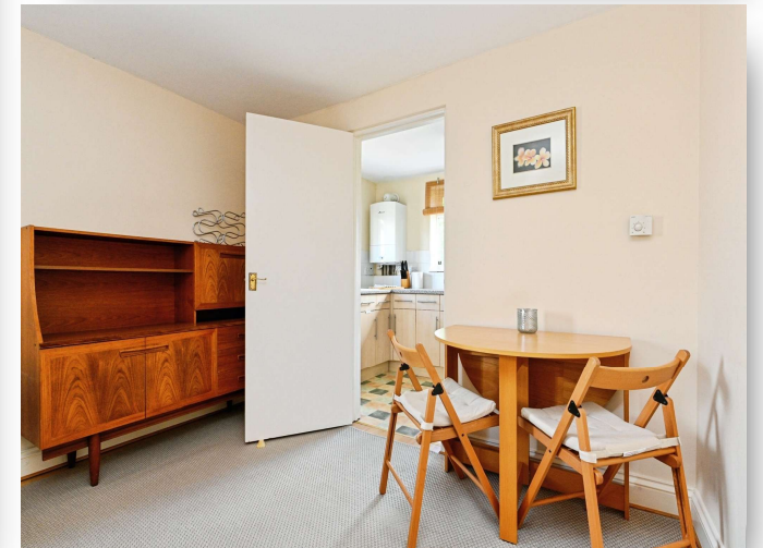
Breckland House, Church Road, Downham Market, PE38 9LE