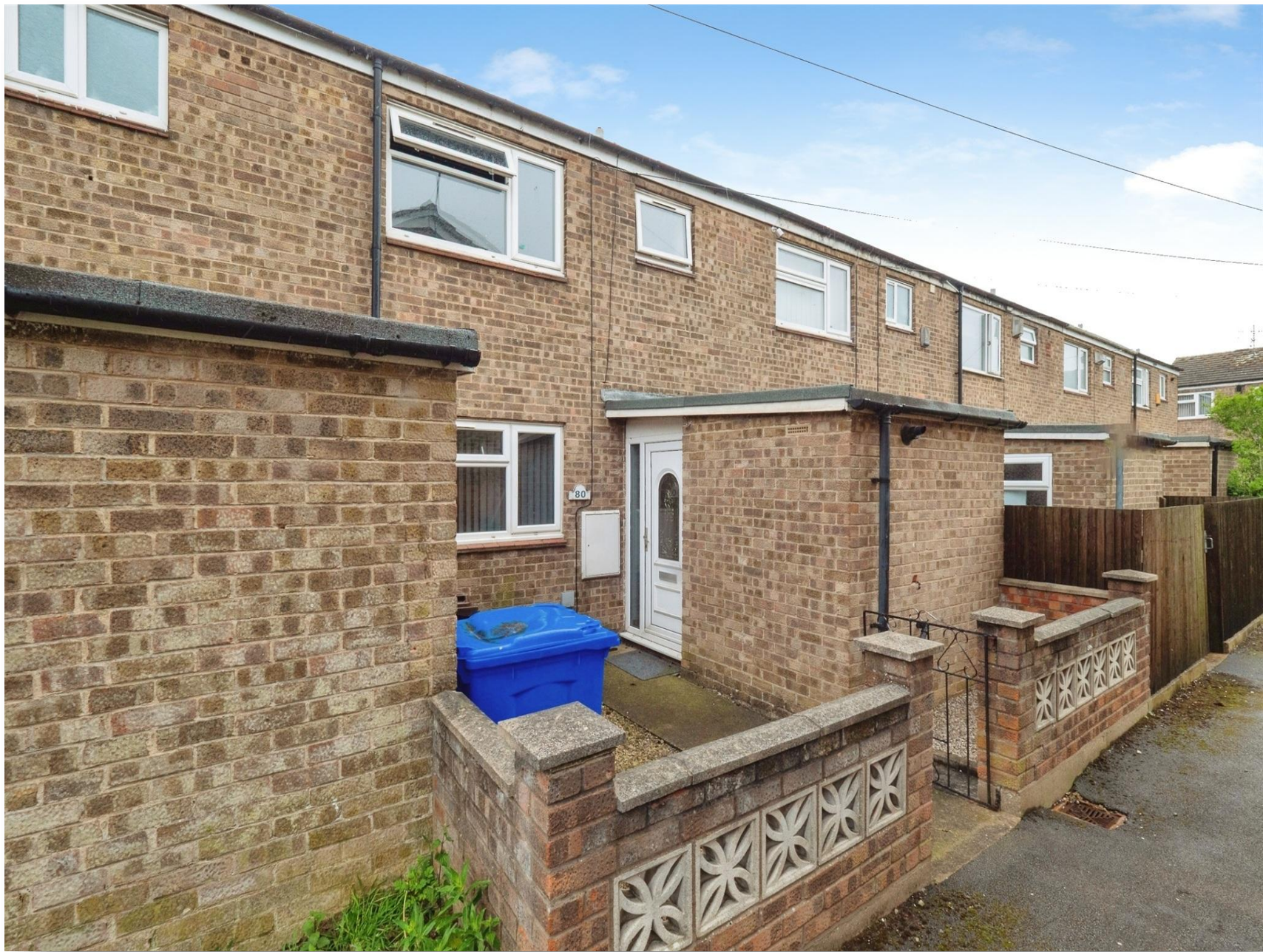
Wimborne Close, Bransholme, Hull, HU7 6AF