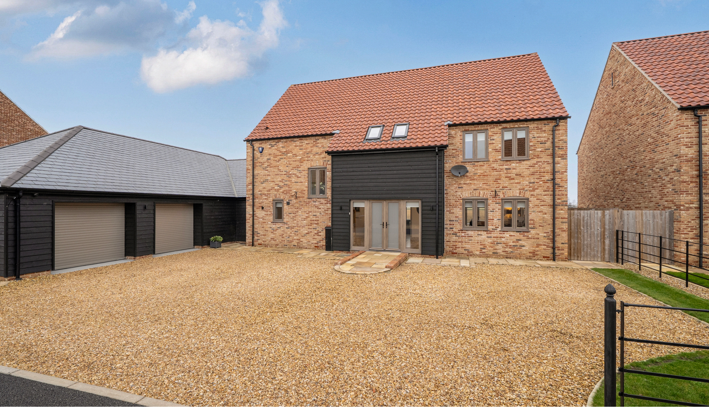
Field Views Lane, Terrington St. Clement PE34 4FP