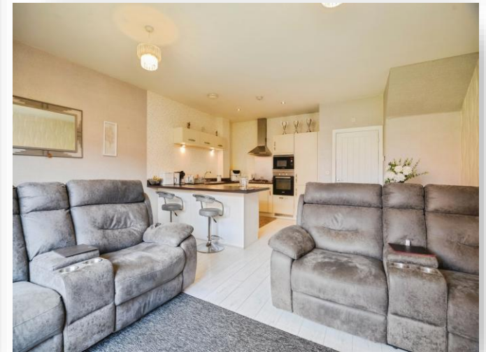
Granton Court, Stockton-On-Tees TS18 2SY