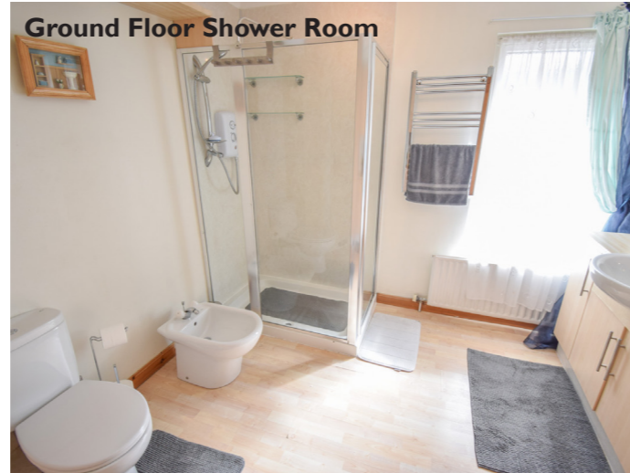
Ground Floor Shower Room