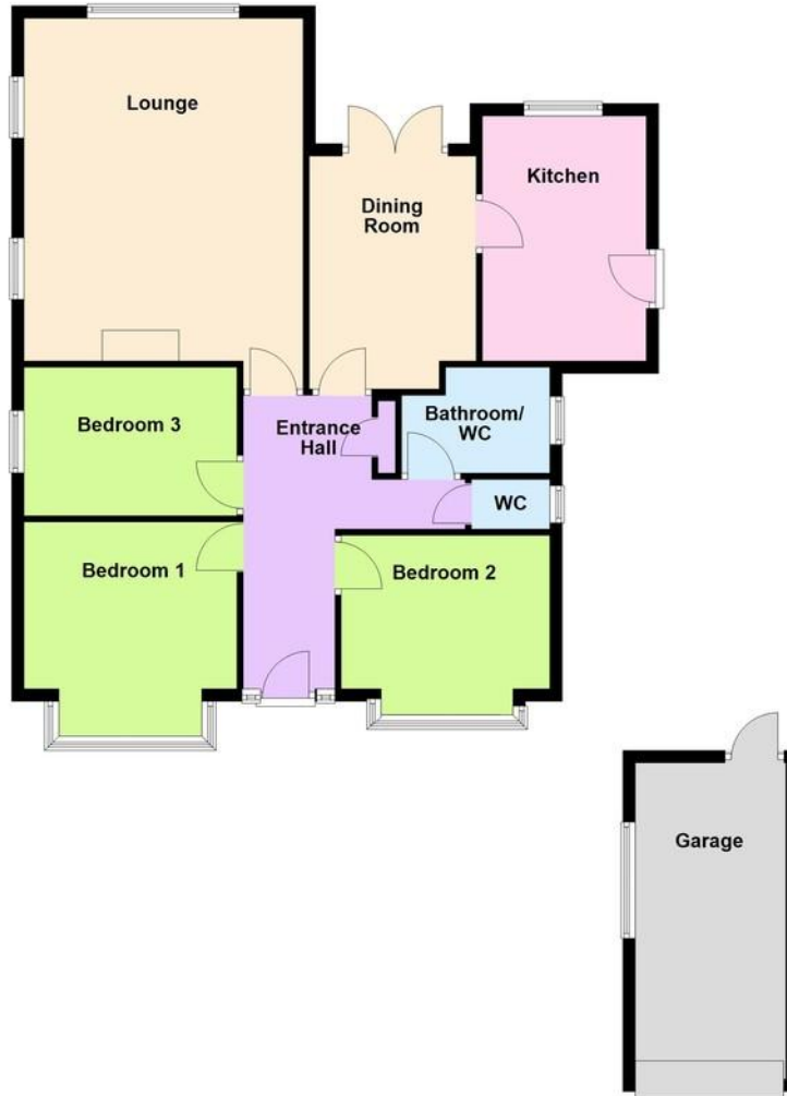
Total area: approx. 106.6 sq. metres (1147.3 sq. feet)