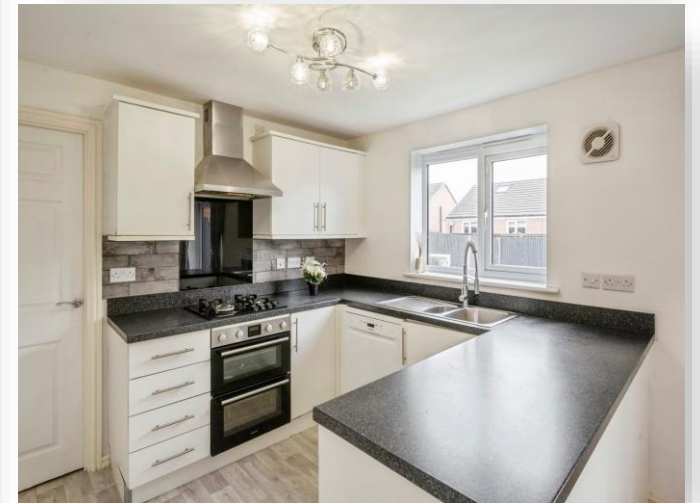
Hughes Way, Wath-upon-Deerne ROTHERHAM S63 6FU