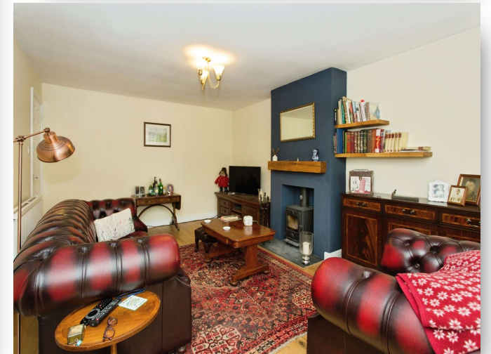
Grantchester Rise, Burwell, Cambridge, CB25 0BE