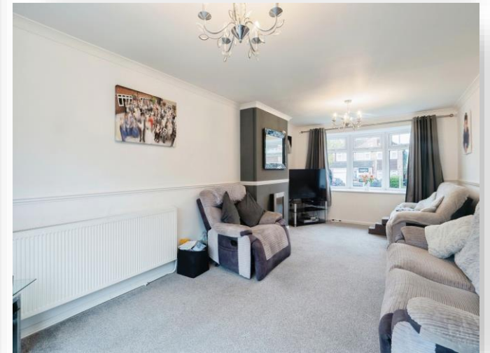
Bagley Close, Loughborough