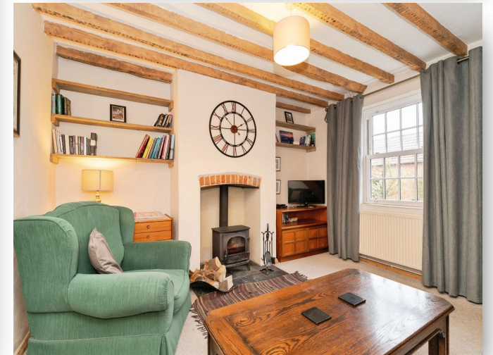
Constitution Hill, Fakenham, NR21 9EF