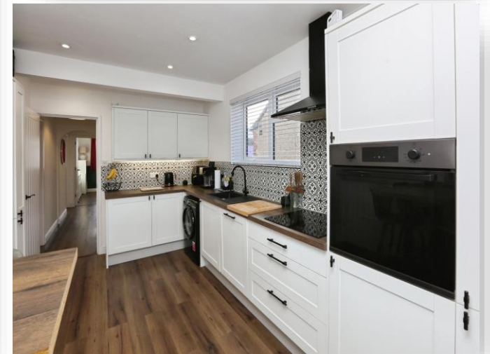
Braemar Close, Gosport, PO13 0YE