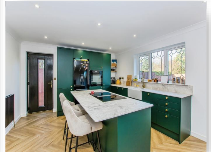
Kezia, Chapel Lane, Elm, Wisbech, PE14 0DJ