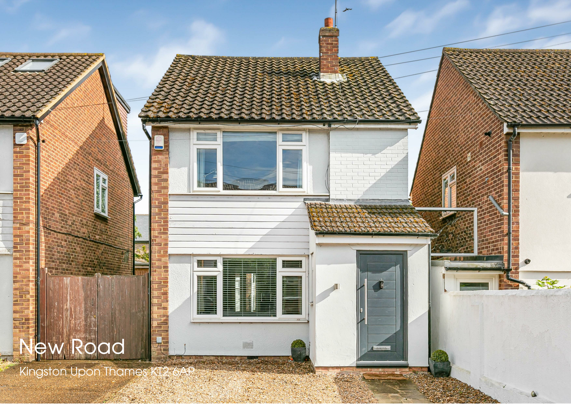
New Road Kingston Upon Thames KT2 6AP