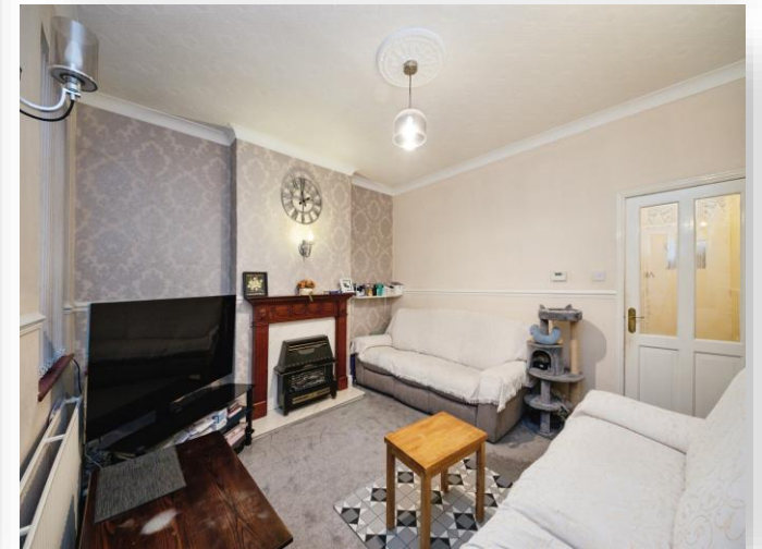
Bromyard Road, Birmingham B11 3BA