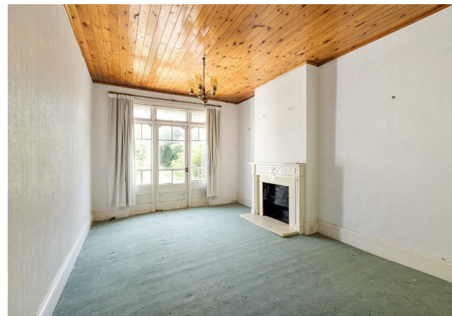
Reception Room 13'4" x 11'9"