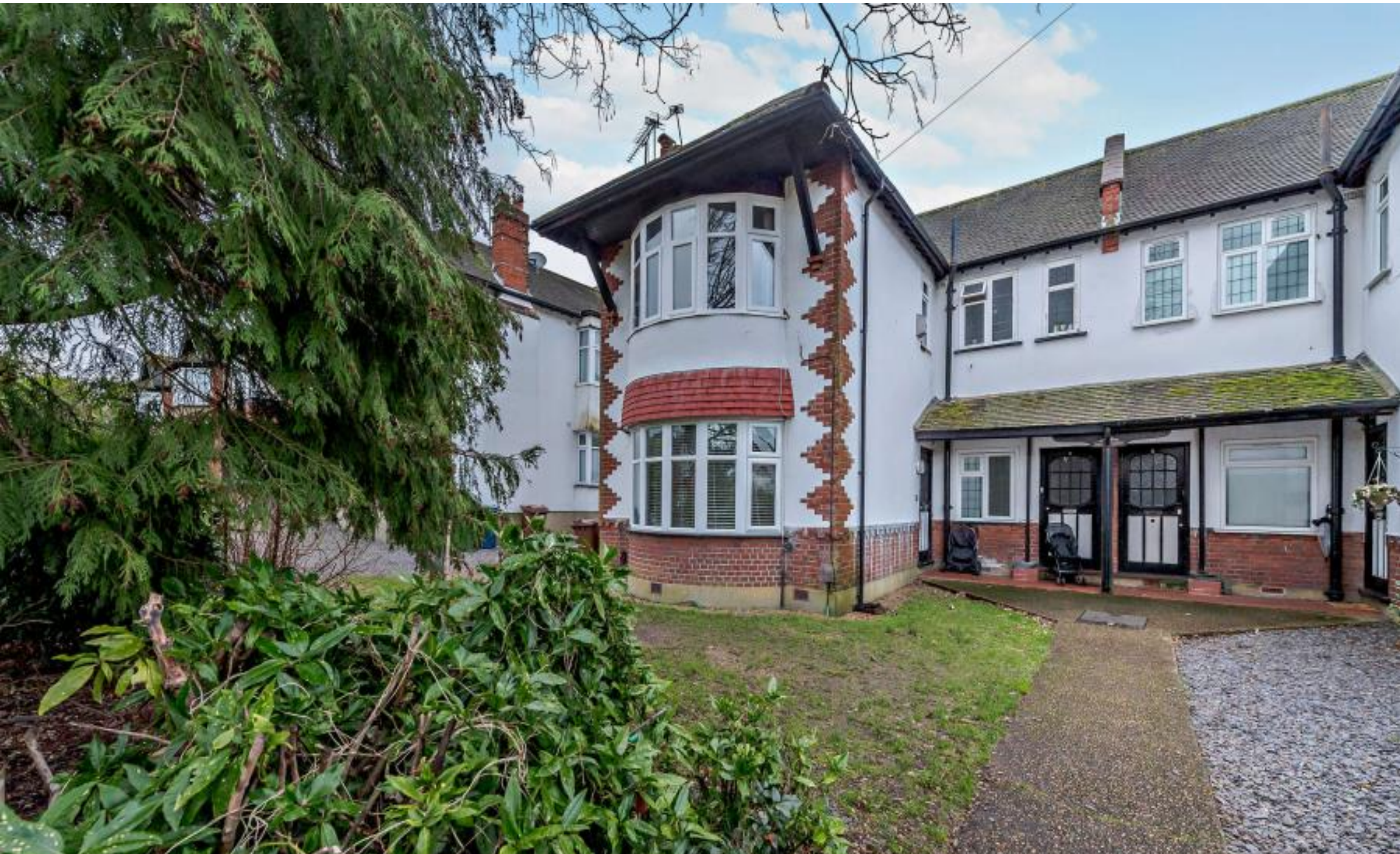
A two bedroom maisonette with private garden close to the amenities of Pinner West End Court, Pinner, HA5 1BP