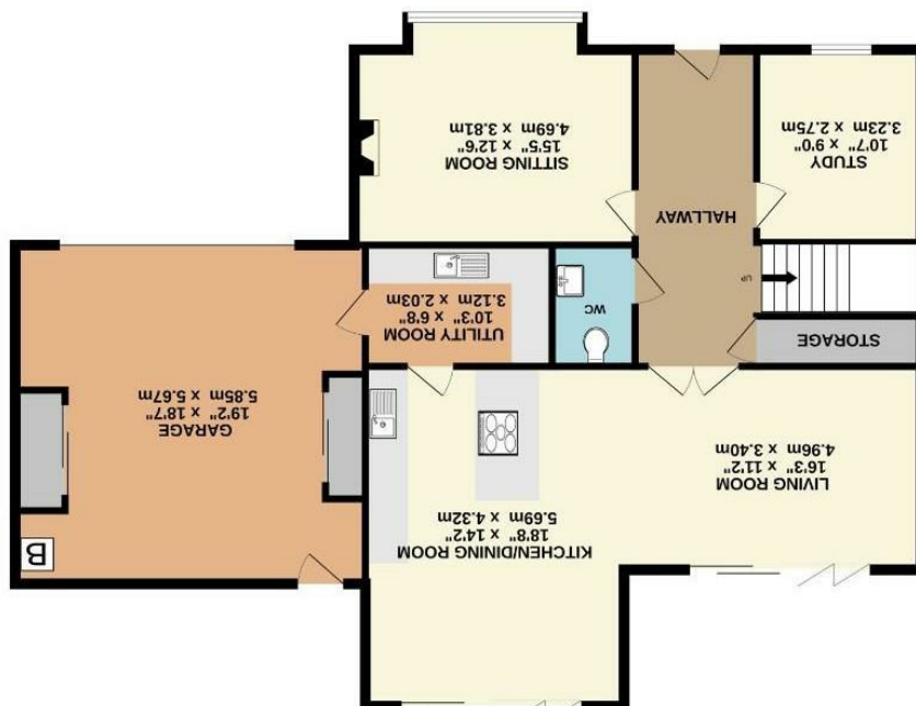
GROUND FLOOR 1353 sq.ft. (125.7 sq.m.) approx.