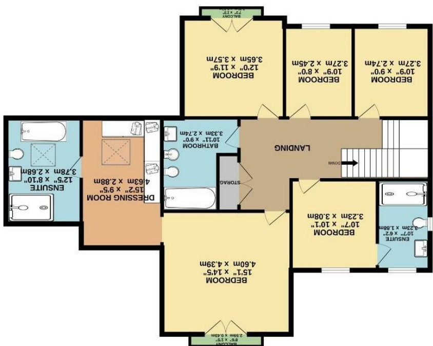
1ST FLOOR 1249 sq.ft. (116.0 sq.m.) approx.

TOTAL FLOOR AREA: 2602 sq.ft. (241.7 sq.m.) approx. Measurements are approximate. Not to scale. Illustrative purposes only. Made with Metropix ©2025