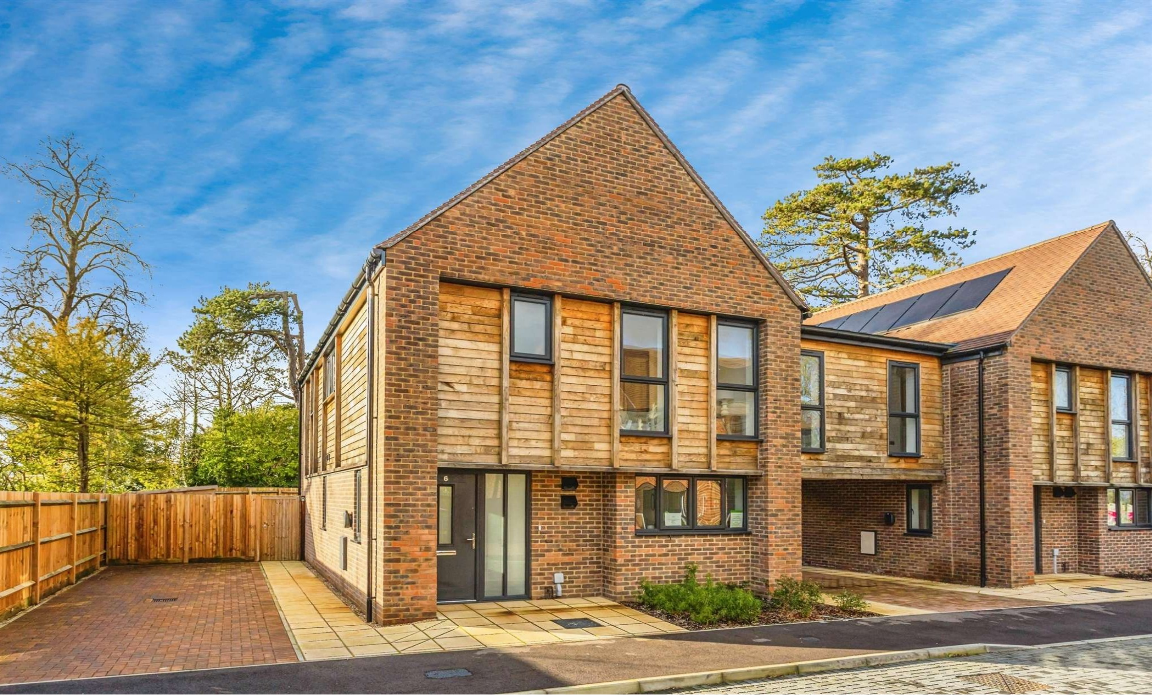
Hanlye View, Hanlye Lane, Cuckfield, Haywards Heath RH17 5HN