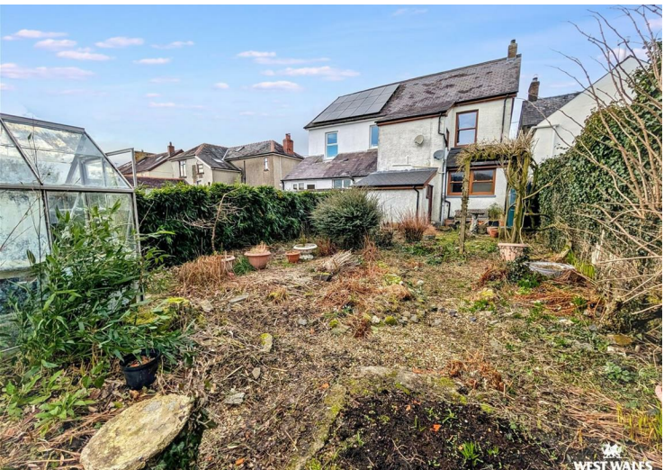
Attractive Semi-Detached Home with Countryside Views and Character Features.

Located in the popular village of Llanfihangel-Ar-Arth, this appealing semi-detached house offers well-arranged accommodation over two floors and enjoys beautiful open countryside views to the rear, creating a peaceful and scenic setting.