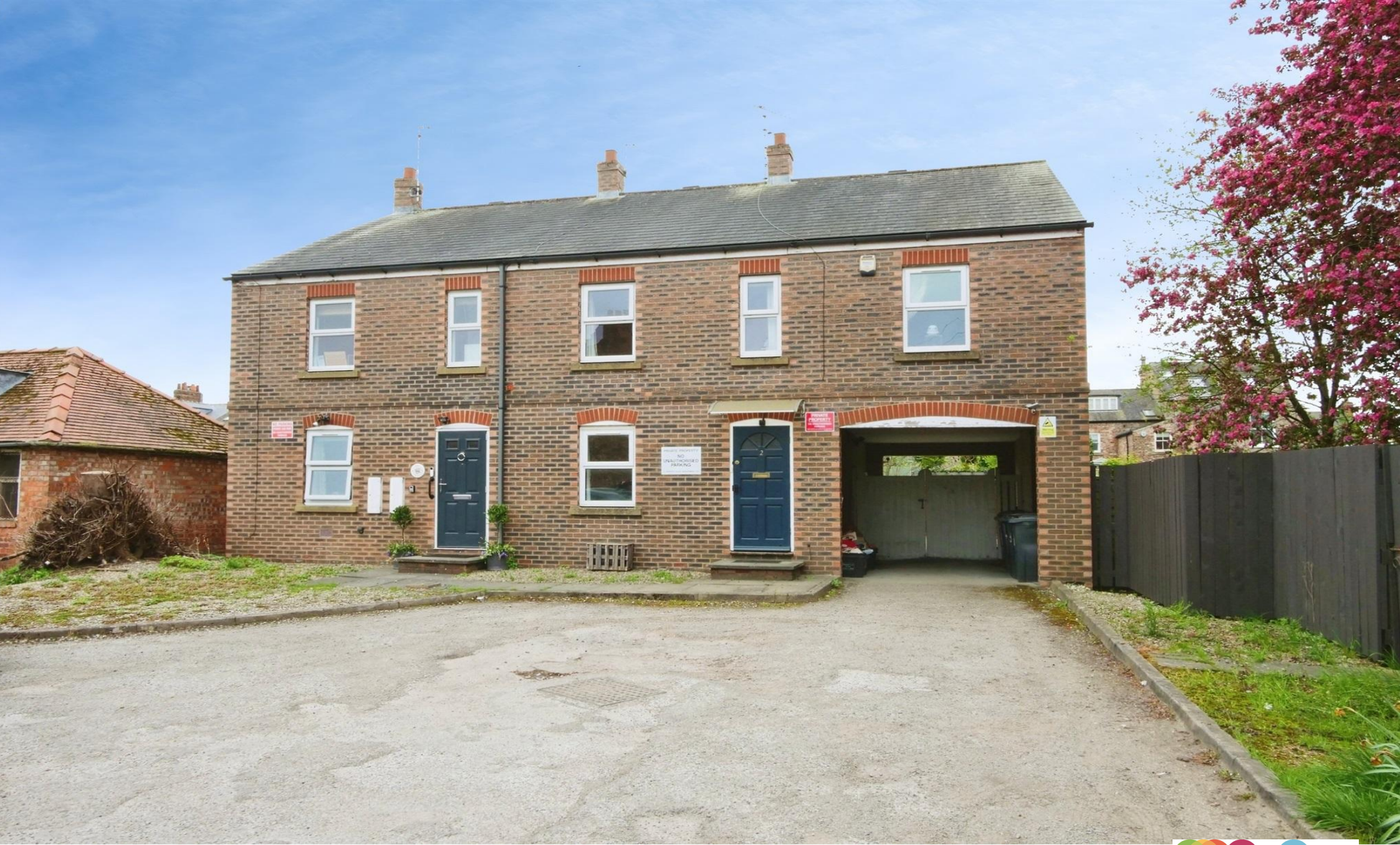
Heworth Place, York YO31 0AB