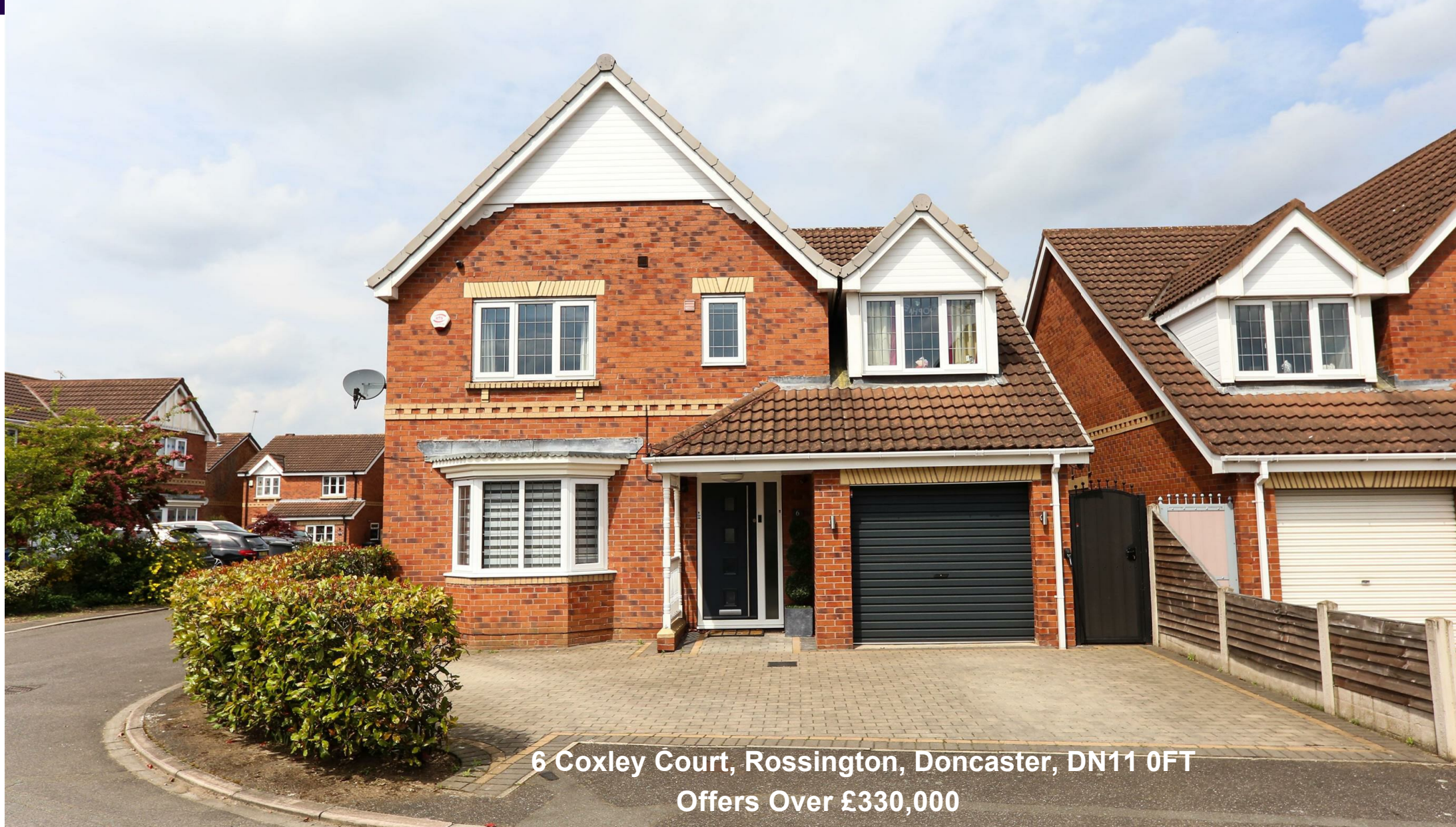
6 Coxley Court, Rossington, Doncaster, DN11 0FT Offers Over £330,000