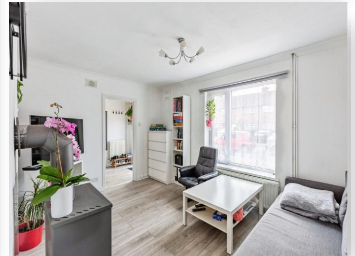
Chelveston Drive, Corby NN17 2QG