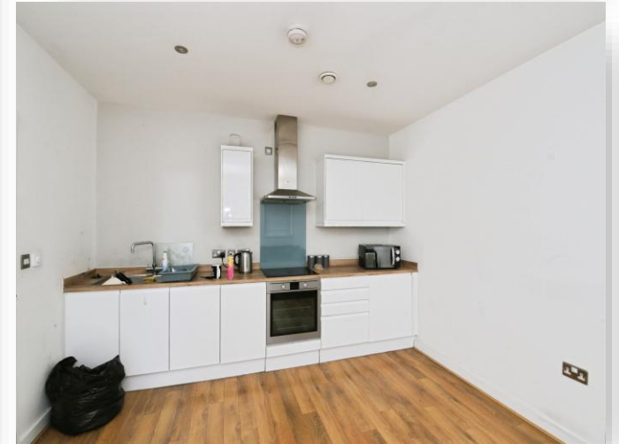
18 Cathedral View Wentworth Street, PETERBOROUGH PE1 1DS