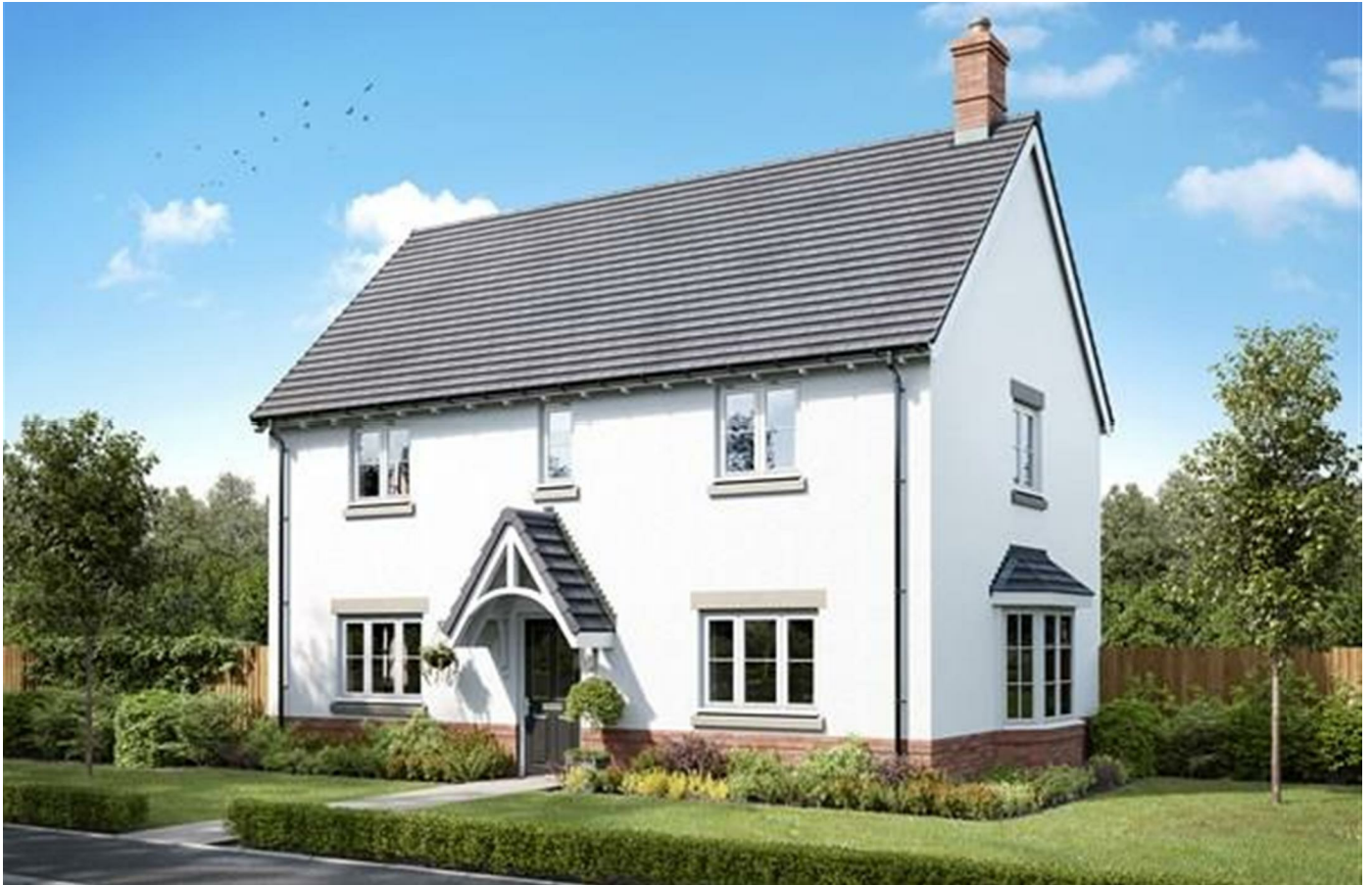
off Hospital Lane, Bedworth