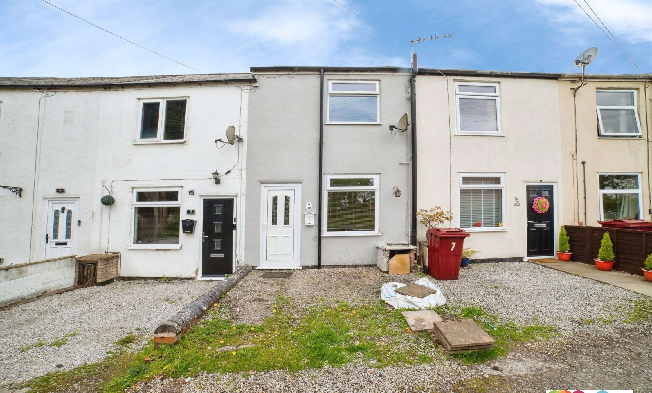
Blacks Lane, North Wingfield Chesterfield S42 5LW