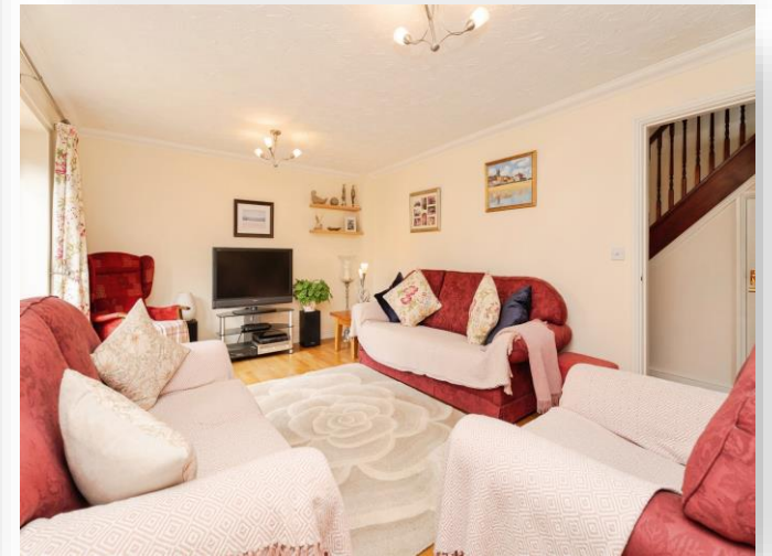
Southgate Way, Briston Melton Constable NR24 2SD