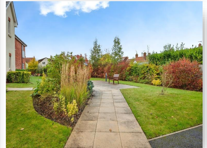
Louis Arthur Court, New Road, North Walsham NR28 9FJ