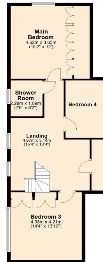
First Floor Approx. 79.6 sq. metres (856.3 sq. feet)

Total area: approx. 278.9 sq. metres (3002.2 sq. feet)