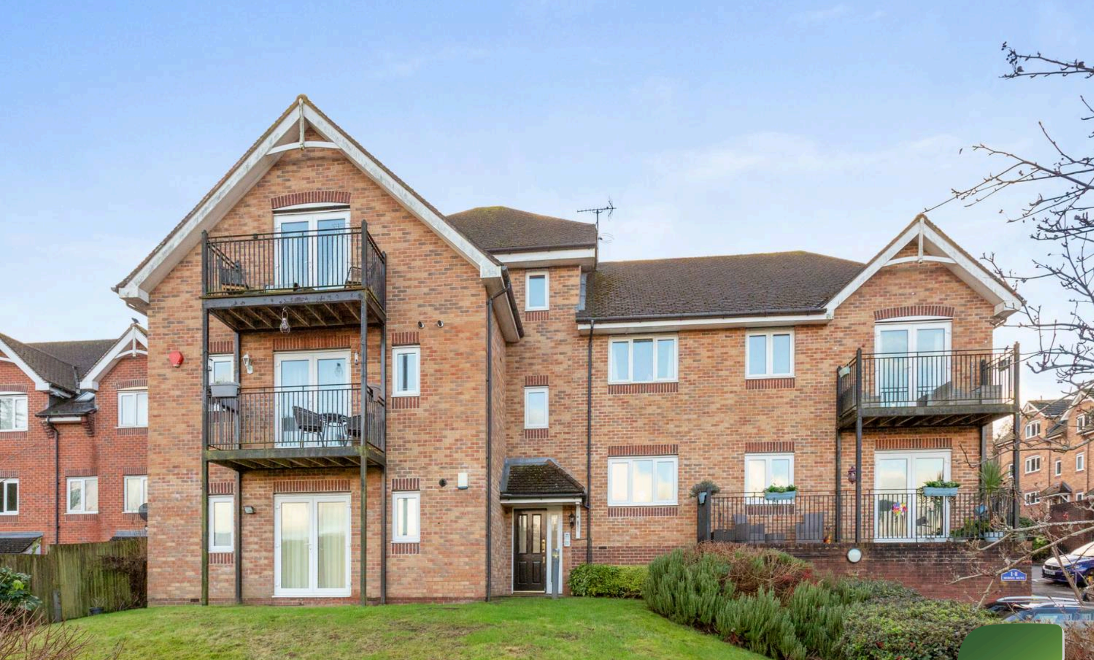
6 Morris Mews Rugby Rise, High Wycombe £270,000