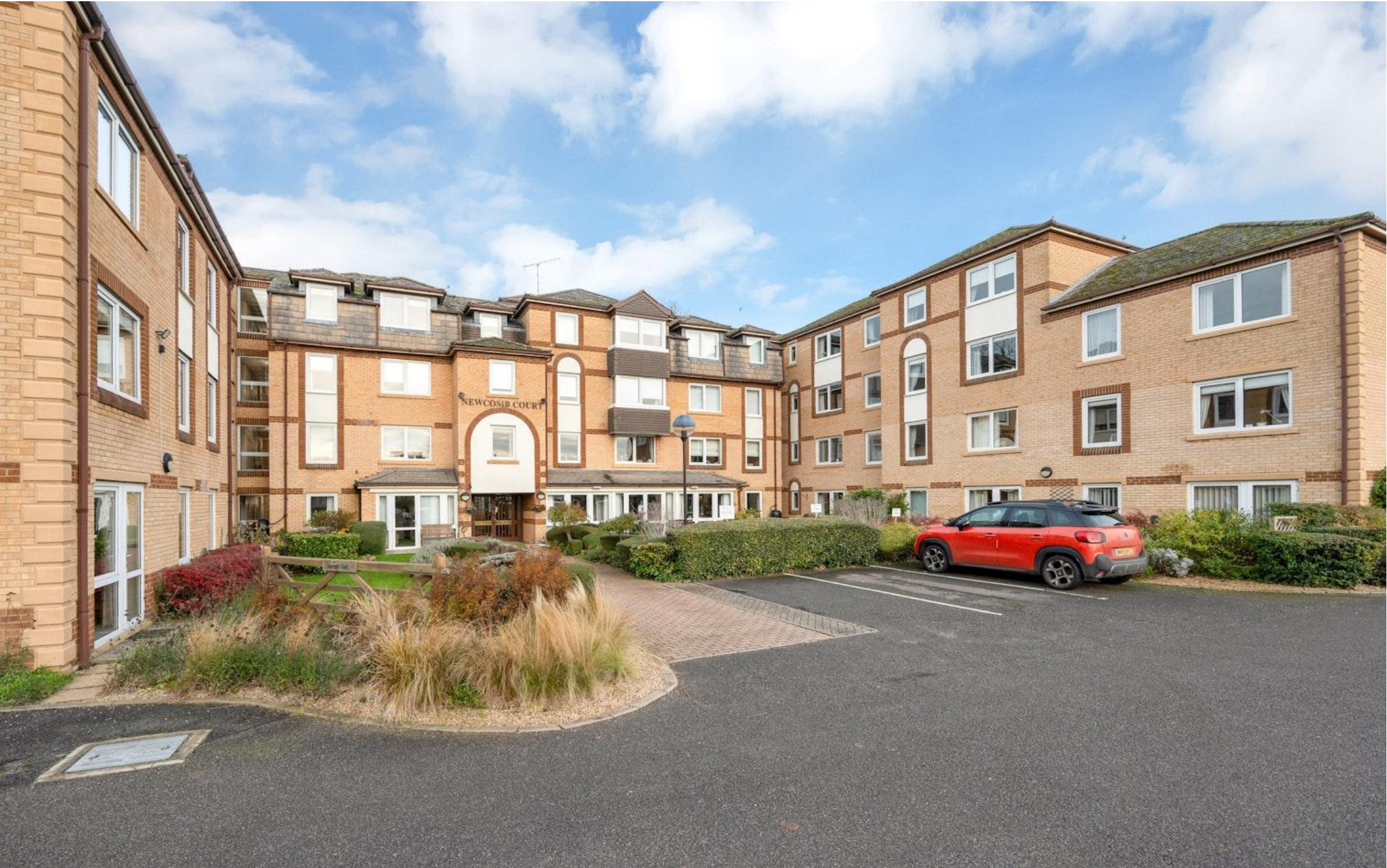
Newcomb Court, Stamford