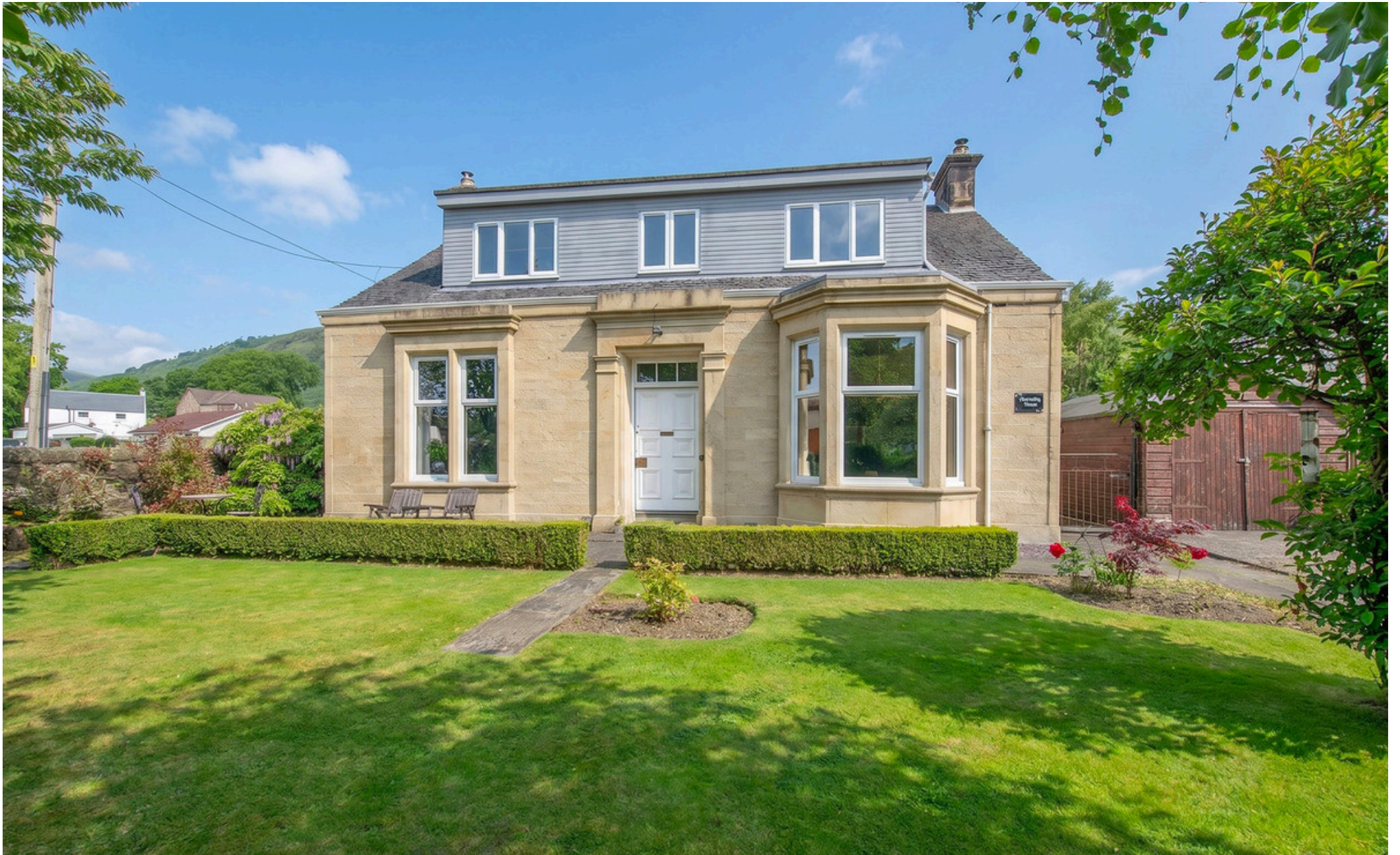
Abernethy House, Hareburn Road, Tillicoultry FK13 6DB